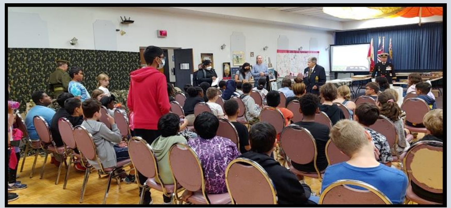
Students from Laura Secord School

Between 18 – 23 September 2023 the Vintage Signals Team joined Royal Canadian Legion Branch 11 (Danforth) to conduct presentations during Legion Week. Signals military history was presented to a new generation of Canadians, all of whom seemed to truly enjoy the presentations.