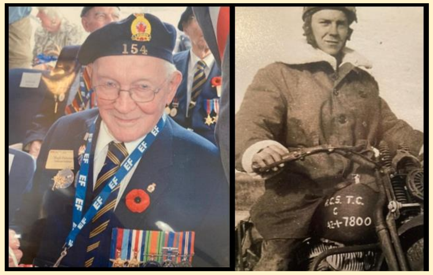
75<sup>TH</sup> Anniversary of D-Day, Normandy, France, 2019